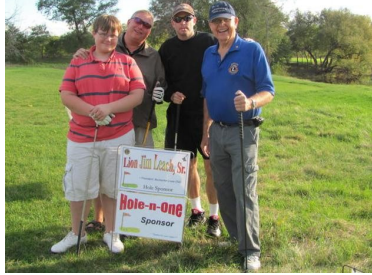
The Leach Clan