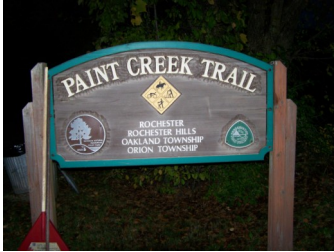
Paint Creek Trail sign