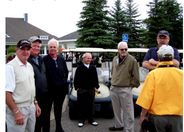
Golfers getting ready for the shot gun start