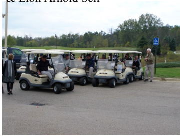
They're off to a shot gun start