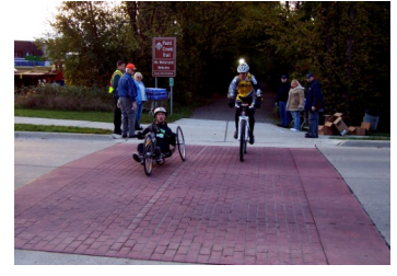
First marathon bike riders